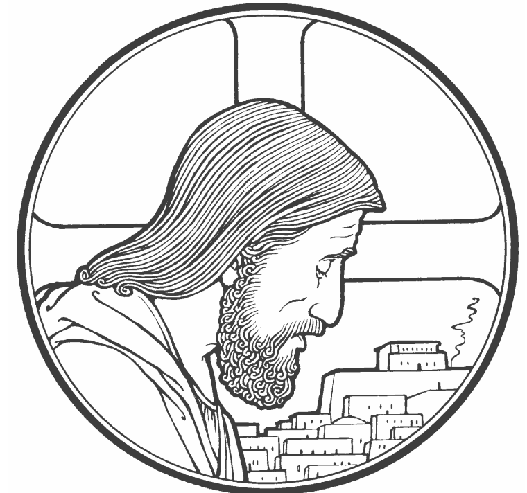
Jesus Weeps Over Jerusalem

O Jerusalem, Jerusalem, the city that kills the prophets and stones those who are sent to it! How often would I have gathered your children together as a hen gathers her brood under her wings, and you were not willing!