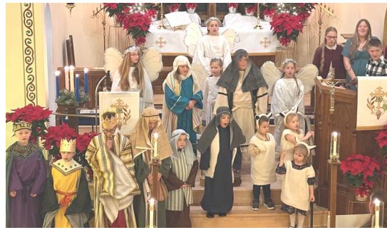
The Congregational Christmas Program was held on December 24 th and featured the Sunday School Children and our Adult Choir.