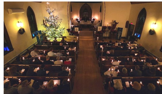
The candlelight service.