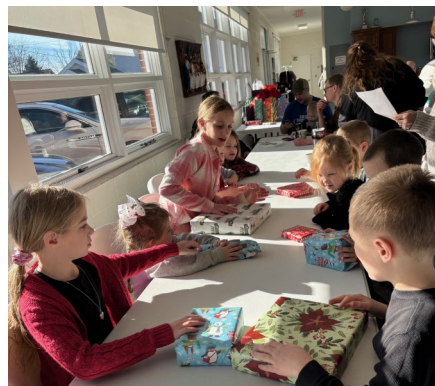
Kids' table at the Family Christmas Party hosted by the Ladies' Aid