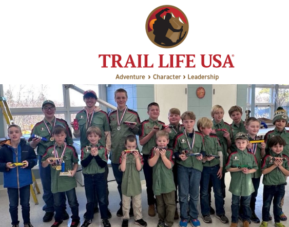
Our Trail Life and American Heritage Girls troops continue to be active with the girls learning about All God's Children and enjoying an Engineering badge day; while the boys participated in their first Pinewood Derby.