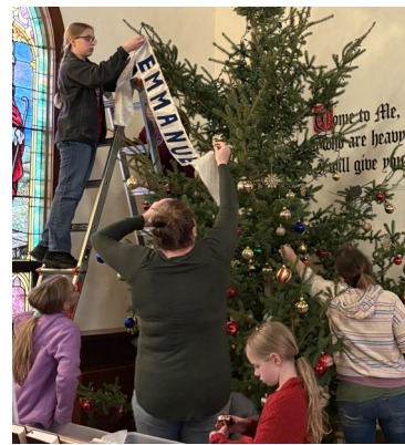
Undecorating the Christmas Tree. Thanks to all who serve in various ways.