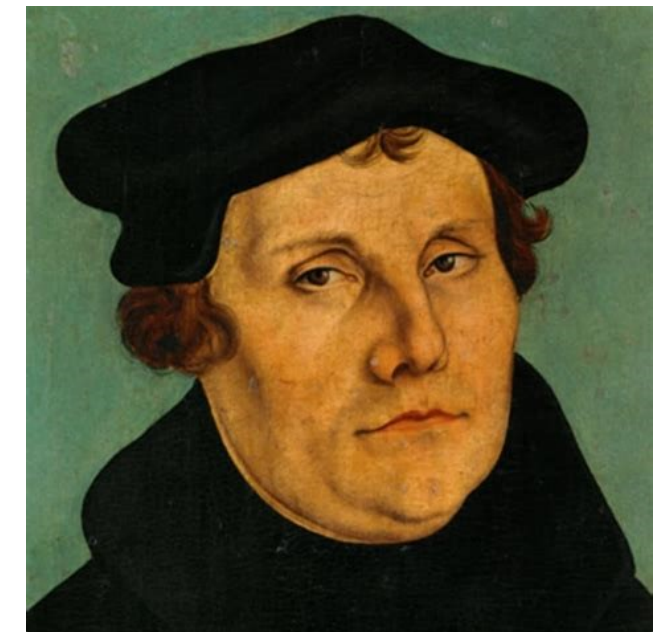
Martin Luther (1517—1546)

◆ Fall Clean Up has been scheduled for November 2 nd starting at 9 a.m. and ending with lunch at Noon. The sign-up sheet will be in the narthex soon. Please consider signing up to help.