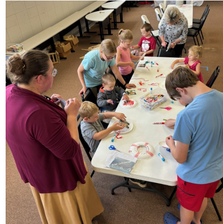
Making VBS crafts

VBS for all ages was held on July 17 th . Water games were played, Bible stories told, crafts made, pizza eaten and the day was closed out with the Midweek Divine Service.