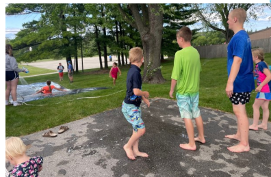
Kids having fun on the water slides