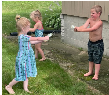
Water balloon fight