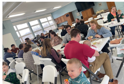
Participants enjoy a meal in Memorial Hall.