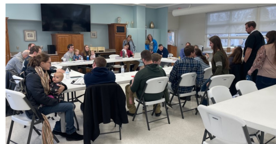
Pastors and wives gather around God's Word.