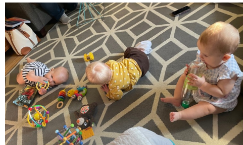
Five "PALS Babies" were born from January-March 2023. Three of them enjoy their new friends in the parsonage living room.