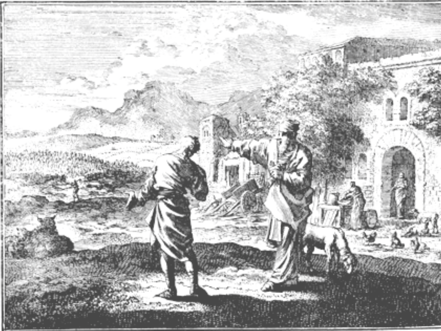
THE PARABLE OF THE TWO SONS

“What do you think? A man had two sons. And he went to the first and said, ‘Son, go and work in the vineyard today.’