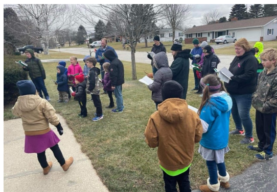
Neighborhood Christmas Caroling after practice.