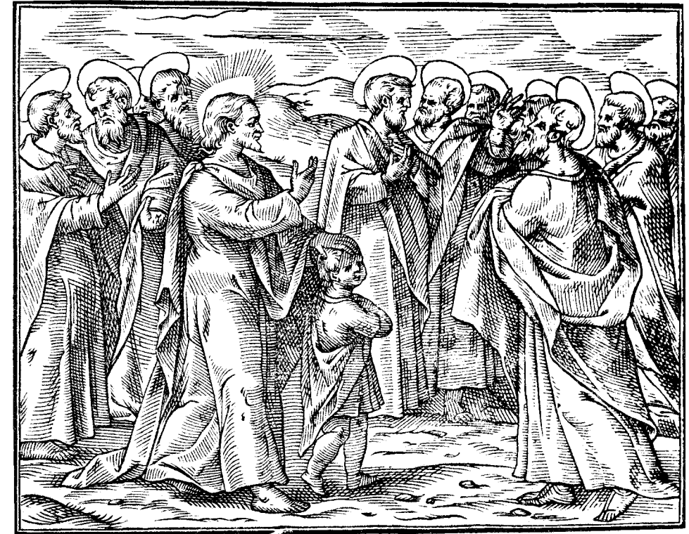
The Disciples Argue About Greatness

If anyone desires to be first, he shall be last of all and the servant of all. Mark 9:35